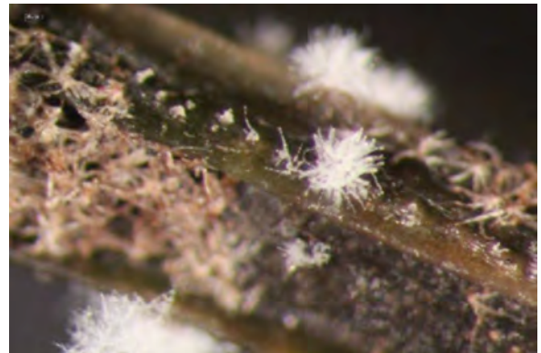
White tufts of conidiophores and spores of boxwood blight produced from black stem lesions. The darker tufts are plant trichomes.

Spread: The disease is primarily spread via infected plants and plant debris. Infected leaves drop and can contaminate the soil beneath the plant. Infected leaves may also be carried by water, wind, on shoes or tires, or on animal fur as they rub against infected plants. The fungus produces white tufts of clustered spores on infected leaves and stems under wet conditions. The spores are very sticky and they will stick to pruning tools, shovels, worker's clothing and hands, as well as fur and feathers of wild and domestic animals (dogs, cats, rabbits, wild turkeys, etc.). Although it is very easy to spread this disease, the spores are not wind-borne. They must be moved on plants, tools, etc. or in water.