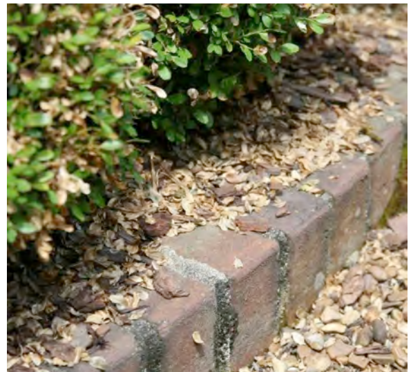
Fallen leaf litter beneath boxwood blight infected plants. Debris must be removed or buried to reduce disease spread.

If Boxwood blight is detected, the infected plants and all fallen leaf debris needs to be bagged on-site and removed from the area to be buried in a landfill to prevent its spread. Transport plants in closed bags. Leaf litter blowing from open trucks could spread the disease to plantings along the roadway. Fallen leaf debris should be vacuumed and bagged, burned on-site or buried.