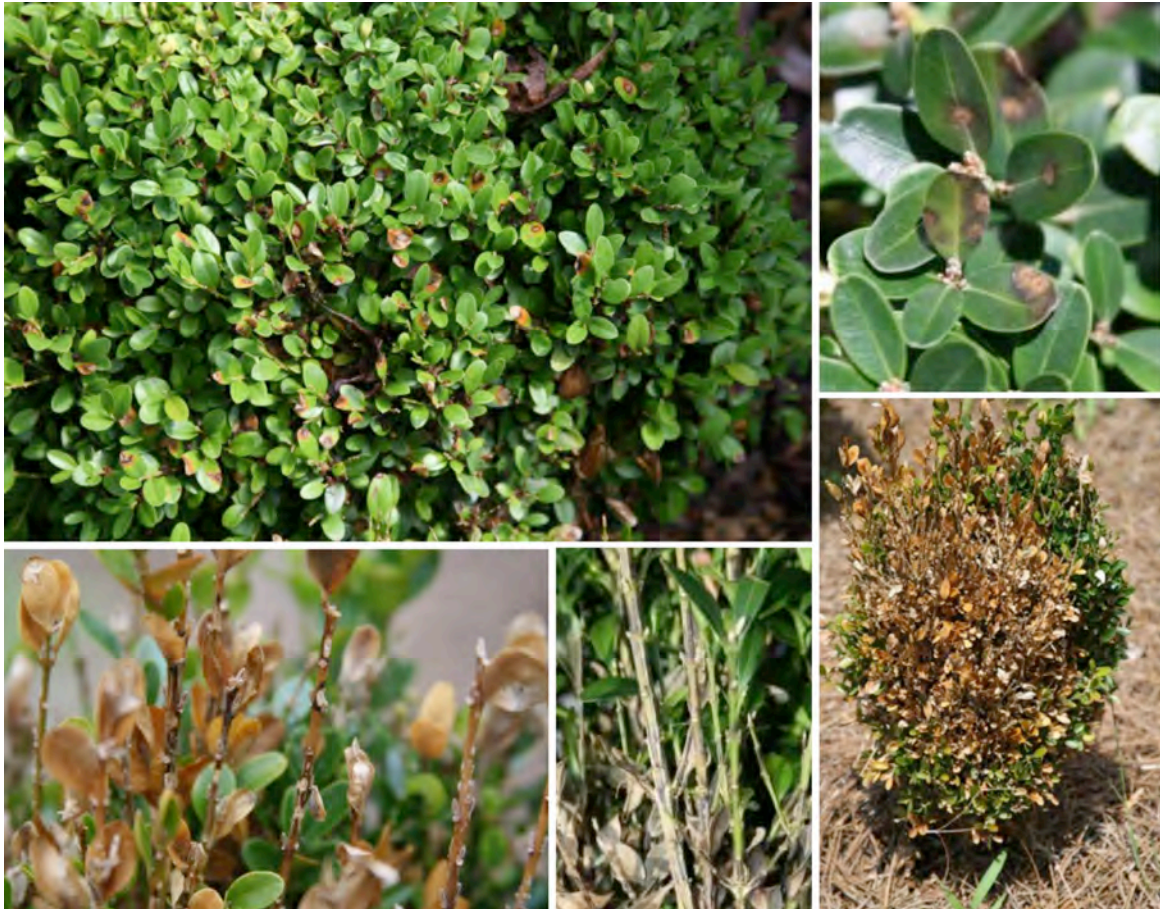
Boxwood blight symptoms clockwise from upper left: Tan to gray leaf lesions with a darker purplish border on an English boxwood; Circular, tan spots with a brown border on upper leaves; Tan blighted leaves and bare stems on an infected plant; blackening of stems and browning foliage; and black stem lesions on bare branch tips.

History: Boxwood blight was first identified in the USA in the fall of 2011. Since then, it has been identified within nurseries and/or landscapes in multiple states (CT, DE, MA, MD, NC, NJ, NY, OH, OR, PA, RI, VA) and several Canadian provinces. The disease has been known for over a decade in the UK and Europe. This month (June 2014), it was also confirmed in a retail nursery in TN on plants originating from a large commercial nursery in OR. It is likely that infected plants were shipped into other states as well, including GA.